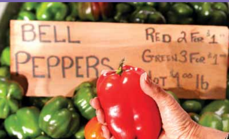
Clear near vision.

The AcrySof® IQ ReSTOR® lens can provide cataract patients with a full range of improved vision.