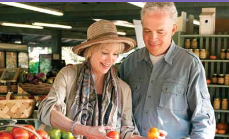
Clear intermediate vision.