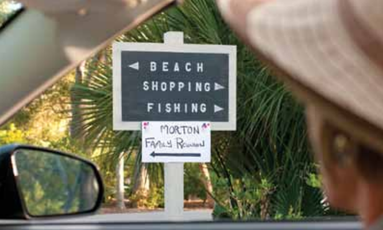
Clear distance vision.