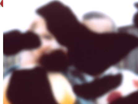
A scene as it might be viewed by a person with diabetic retinopathy.